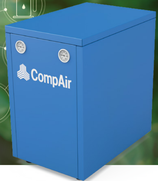
CA Series Energy Recovery Box